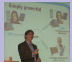
WorkTech06. Niklas Zennstrom, co-founder and CEO of Skype, addressing WorkTech05.