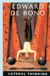
Edward de Bono, Author