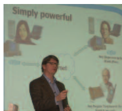
Niklas Zennstrom, co-founder and CEO of Skype, addressing WorkTech05.