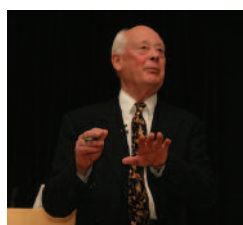
Charles Handy, one of the most respected authors and commentators on the future of work giving his presentation at WorkTech06.