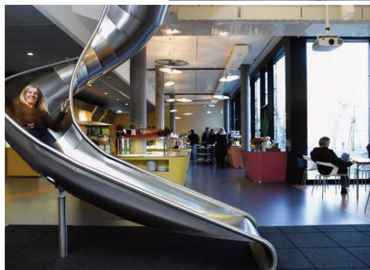
Case Study: Google's incredible new Zurich Office