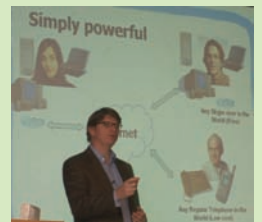
Niklas Zennstrom, co-founder and CEO of Skype, addressing WorkTech05.