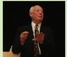
Charles Handy, one of the most respected authors and commentators on the future of work giving his presentation at WorkTech06.