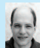
Alain de Botton, Philosopher,